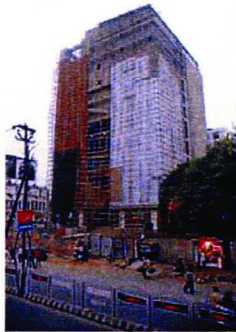
The JD Hi Street Mall at Main Road. (Hardeep Singh)

Ranchi, Nov. 8: The city will soon be mall-nourished.