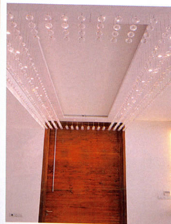
The double height entrance foyer has a floating glass bridge. Controlled light through fenestrations placed strategically as north lights, top lights and structural glazing brighten the interiors.

and narrow passage, one arrives into the double height entrance foyer with a floating glass bridge. Moving ahead, one comes to the family living and dining spaces that open onto a lush green courtyard. The formal entertainment spaces on one side and private sleeping zone on the other define and shade the courtyard.