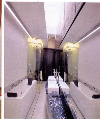
The master bedroom suite is large with seating spaces on one side and a sleeping zone on the other, and a luxurious bathroom with a huge mirror enhancing the space.