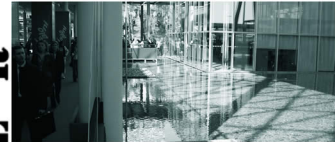
One of the largest exhibitions of its kind outside of China. Milan's Salone di Mobile is a fixture that every interior designer aims at attending. Not just for the size, but more for the opportunity of seeing the latest trends from all across the world, all on display at a single location.

From the moment one reaches Milan- whether by air at Malpensa Airport, or by train, one can sense an air of expectation and anticipation. Every person you seem to meet is either a designer, or an exhibitor. I have met people from around the world here. Last year I met a Slovenian architect from Ljubjana, a Ugandan contractor and a businessman from Panama...an eclectic collection of nationalities if there ever was one!